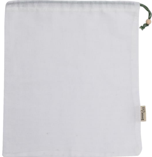
STANDARD 28x32 cm grey-green cord