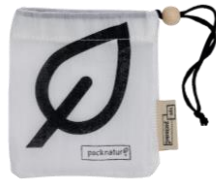
X-SMALL 10x10 cm black cord printed