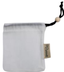
X-SMALL 10x10 cm black cord